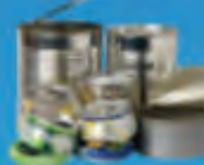
• Food and beverage cans (metal and cardboard)

(Includes clean take-out containers, foam meat trays, foam egg cartons, foam plates and cups, white foam packaging used to pack TVs, computers, stoves, etc.)