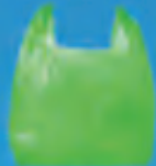
• Plastic bags

(Includes grocery, bread, produce and frozen vegetable bags; dry cleaning bags; water wrapper for toilet tissue and other paper products)