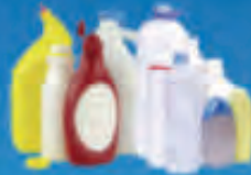
• Plastics #1,2,4,5